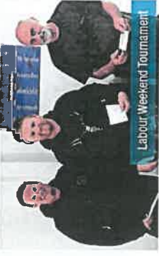
Labour Weekend Tournament