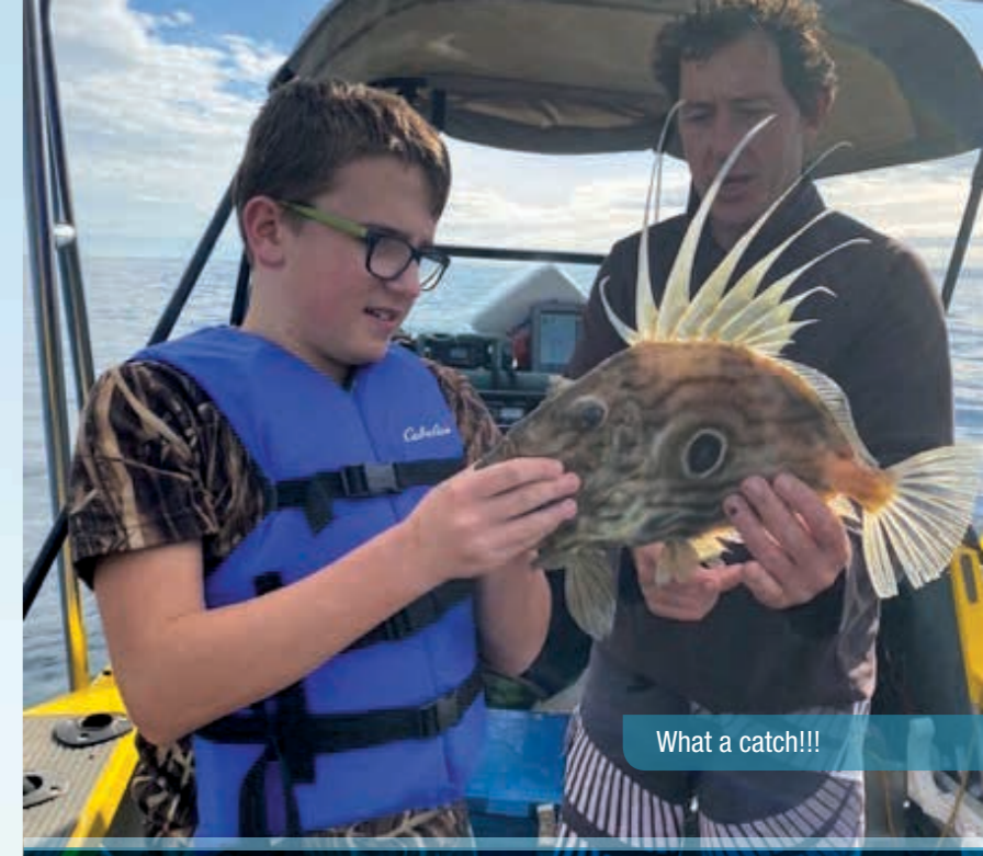
What a catch!!!